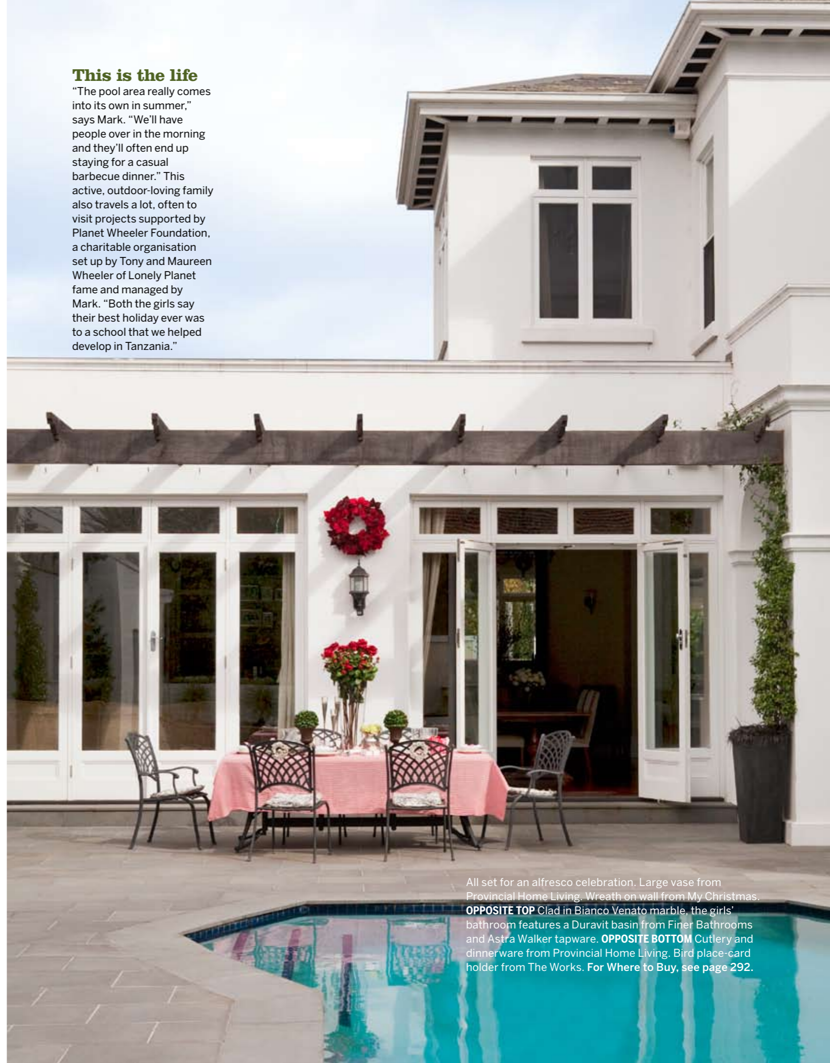
All set for an alfresco celebration. Large vase from Provincial Home Living. Wreath on wall from My Christmas. OPPOSITE TOP Clad in Bianco Venato marble, the girls’ bathroom features a Duravit basin from Finer Bathrooms and Astra Walker tapware. OPPOSITE BOTTOM Cutlery and dinnerware from Provincial Home Living. Bird place-card holder from The Works. For Where to Buy, see page 292.